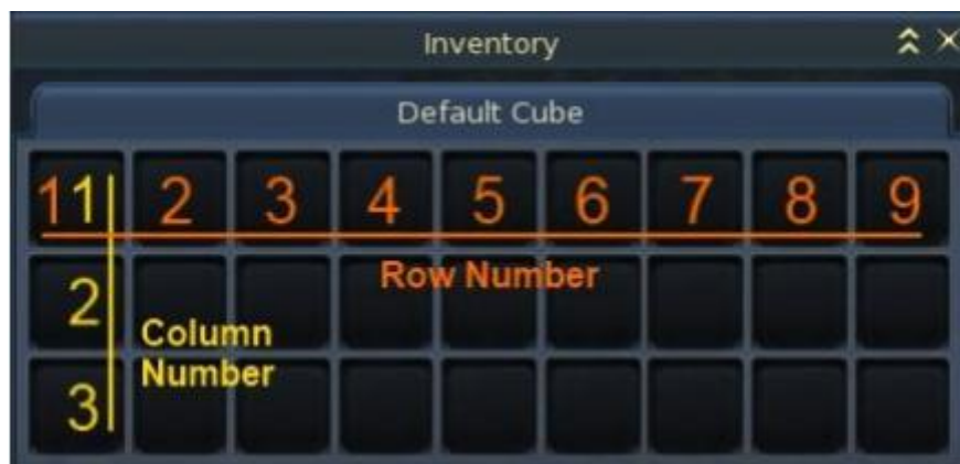
[Horizontal numbers (orange), vertical numbers (yellow)]